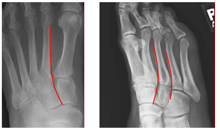
Fig 1A, 1B: (A) normal alignment of 2^{na} metatarsal on ap x-ray. (B) normal alignment of 3^{rd}/4^{th} metatarsal on oblique x-ray