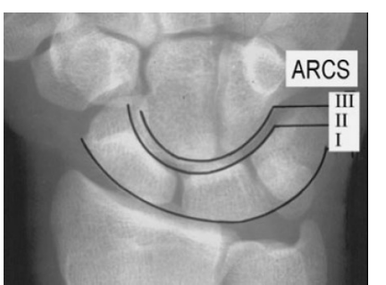
Fig 3: Normal Gilula lines