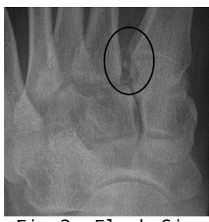
Fig 2. Fleck Sign